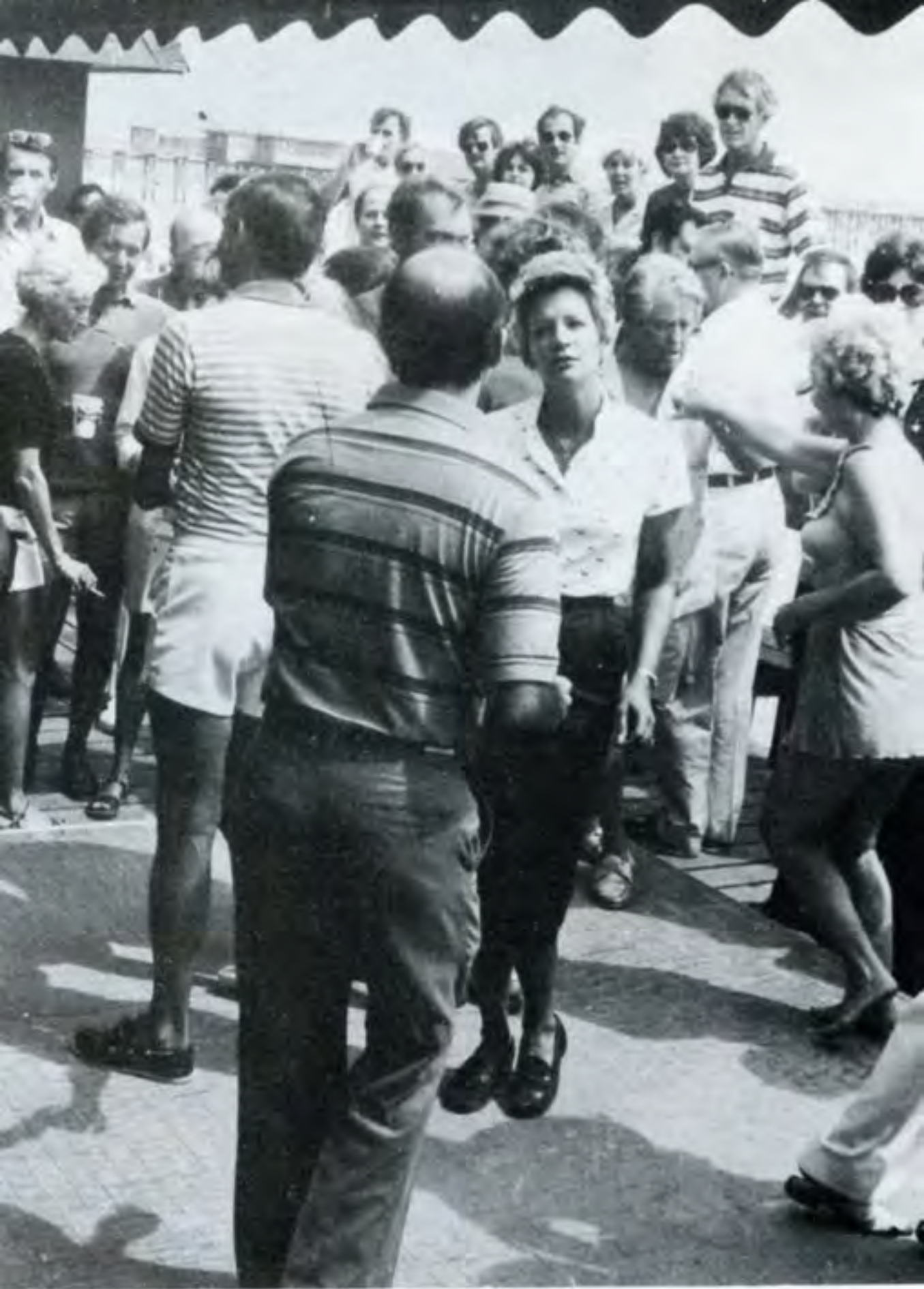
Afternoon at F.J.S