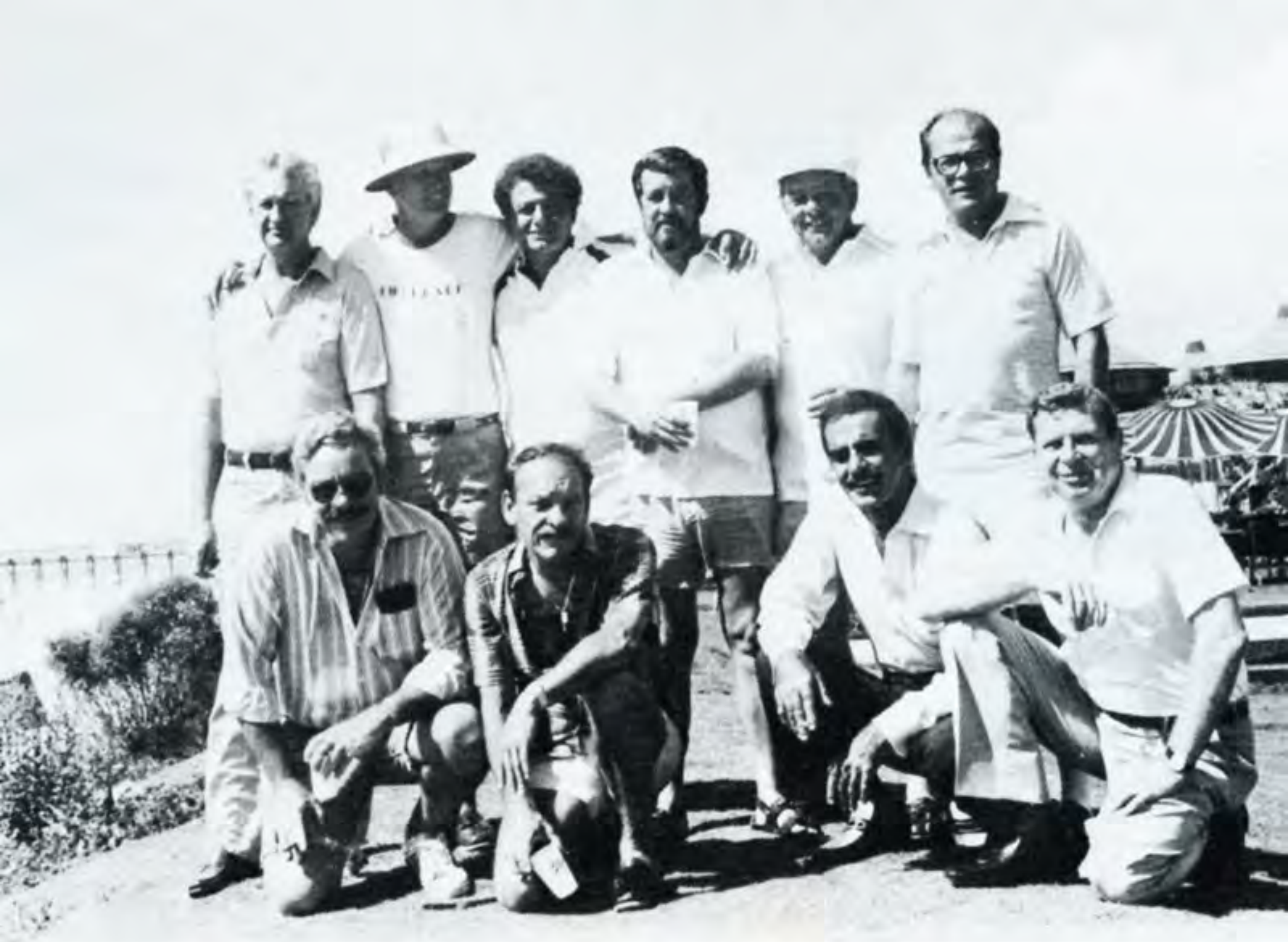
The Beaver Boys