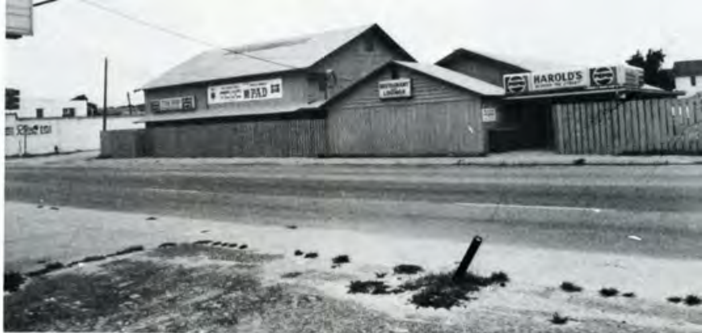
Harold's Across the street