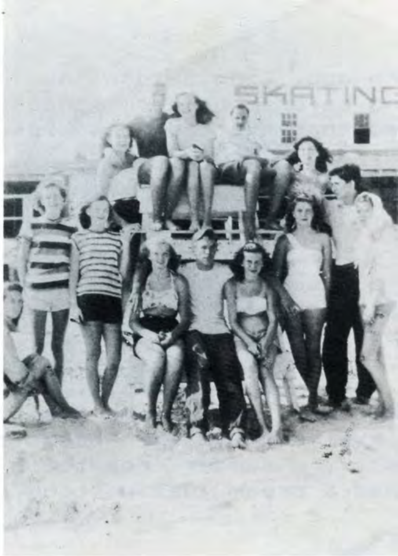
1948 . . . OCEAN DRIVE BEACH