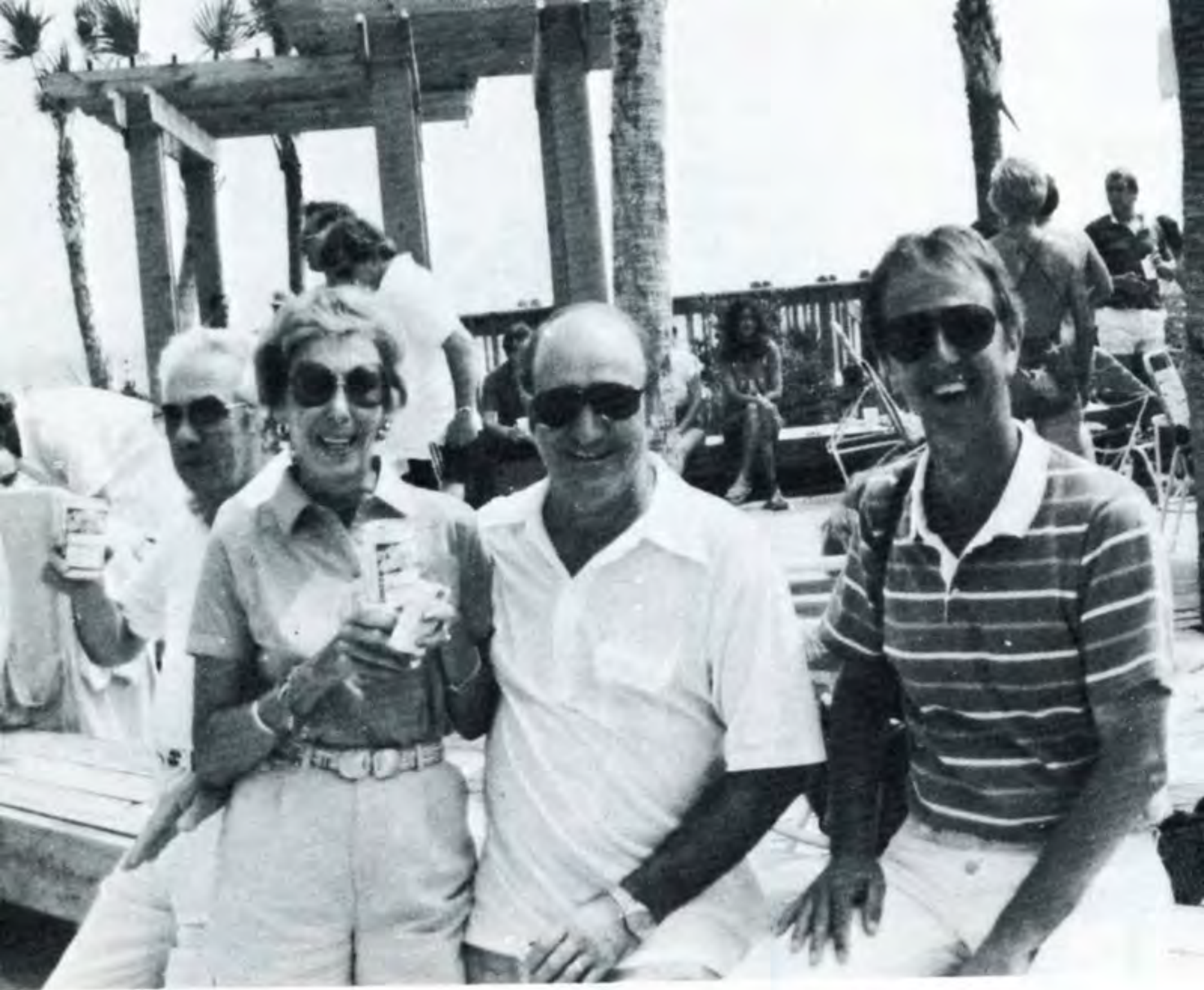
Beach Bums Again...